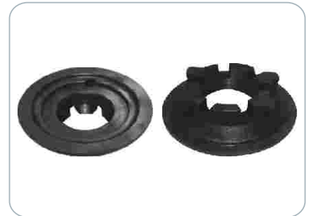
BPW (Eco Model - 14 Ton) Size : 52x2 p