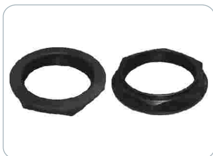
Mercedez Nut Size : 90x2 p