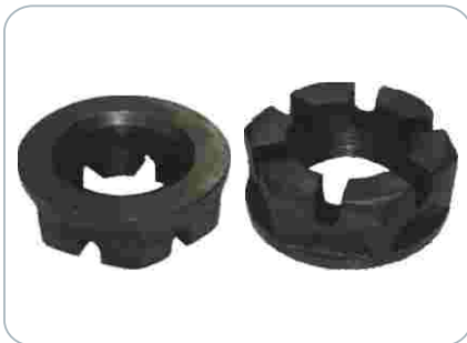
BPW 14 Ton Size : 52x2 p 0326217080