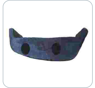
D BRACKET BIG 16012