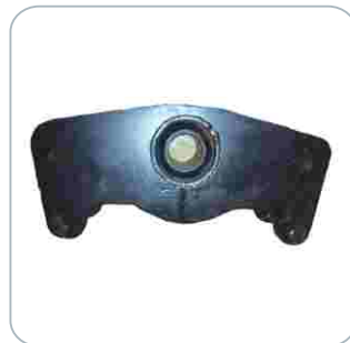
EQUALISER BPW 50mm W/BOLT 16019