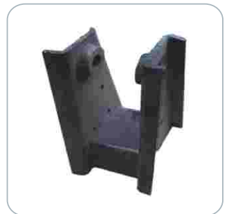
CENTRE HANGER BPW 16020