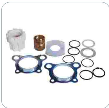
EORK-BCS-05 OEM PART No. 3268000600