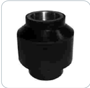
OEM PART No. 0203160600 ID - 30 mm (Steel Pipe) OD - 60 mm Length - 102 mm