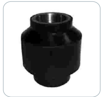
ID - 30 mm (Steel Pipe) OD - 60 mm Length - 82 mm