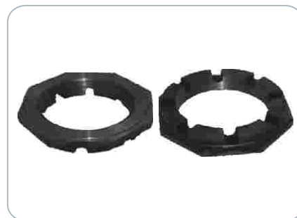
Haandrud / Fruefauf Size : 88x12 tpi