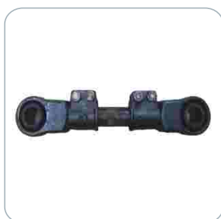
ADJUSTABLE ARM BPW 36mm COMPLETE 16276