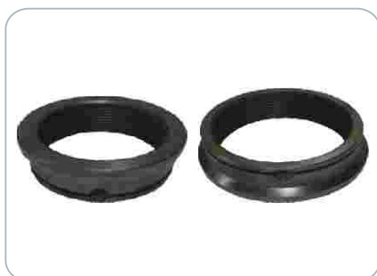
Jesser Nut BPW 16 Ton Size : 180x4 p 0326419030