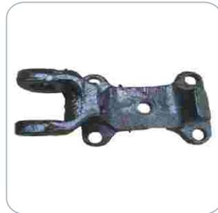
AXLE SEAT BPW (STEEL) 16007