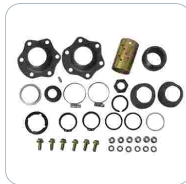
EORK-BCS-06 OEM PART No. 0980102130