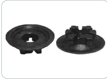
BPW Eco Model 12 Ton Size : 42x2 p