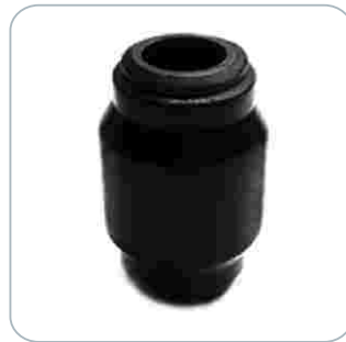
ID - 25 mm (Steel Pipe) OD - 49 mm Length - 76 mm