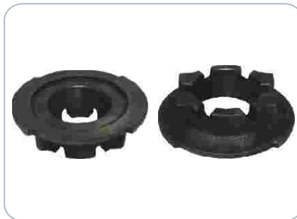
BPW Axle Nut Size : 52x2 p SW80 Part No. 03.262.17.12.0