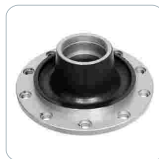
HUB ECO TYPE BIG TRAILOR 16122