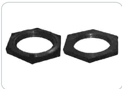
SMB Nut Size : 88x2 p