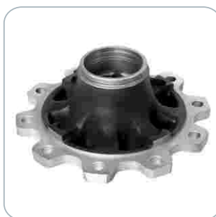
HUB BPW ECO TYPE 10 TON 16113