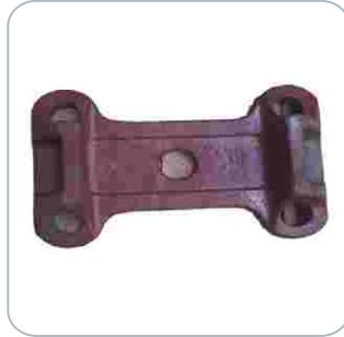
TOP PLATE BPW (5 HOLE) 16010