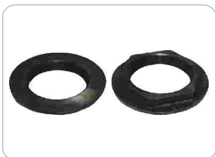
Collar Nut Eco Model (1=LH; 2=RH) Size : 90x2 p