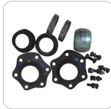
BPW NEW MODEL EORK-BCS-02 OEM PART No. 0311244300