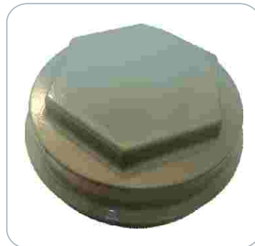
HUB CAP ALUMINIUM 155 x 3 mm