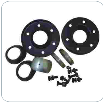
BPW OLD MODEL EORK-BCS-01