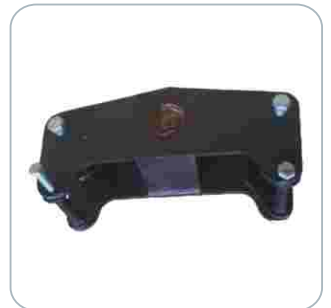
EQUALISER BPW 60mm W/BOLT 16016