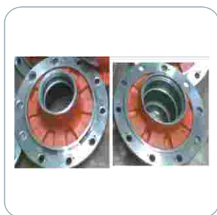
HUB BPW 12 TON 16111