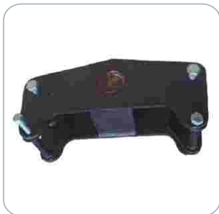
EQUALISER BPW 70mm W/BOLT 16017