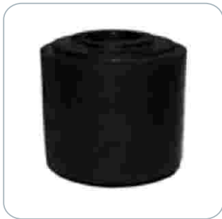
ID - 22 mm (Steel Pipe) OD - 58 mm Length - 57 mm