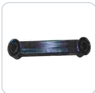
FIXED TORQUE ROD 36mm 16291