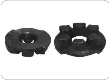
BPW 10 Ton Size : 42x2 p