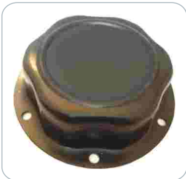
ROR - 21202627