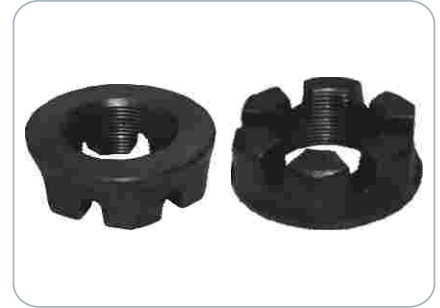
BPW Axle Nut Size : 42x2 p Part No. 03.262.16.02.0