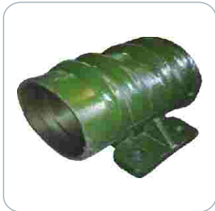
TRUNION BPW 16 TON 16002