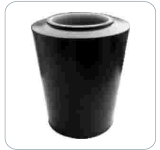
ID - 51 mm (White Steel Pipe) OD - 88 mm - 67 mm Length - 112 mm