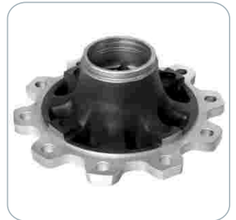
HUB BPW 10 TON