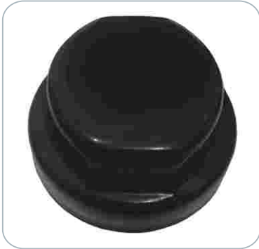
BPW - 136 x 2.5 mm (Inner Thread) 03.212.25.31.0 - 12T N/M