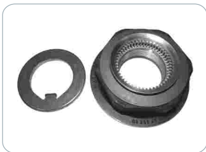
AXLE NUT M52X2 0926647110 EOATG153