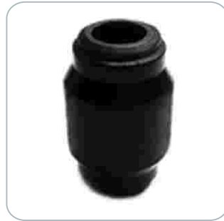
ROR - OEM PART No. 21011745 ID - 22 mm (Steel Pipe) OD - 49 mm Length - 76 mm