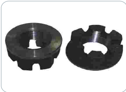
King Pin Nut (Merc and BPW) Size : 45x3 p