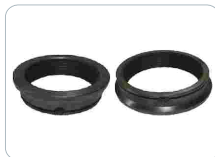
Jesser Nut BPW 12 Ton Size : 125x4 p