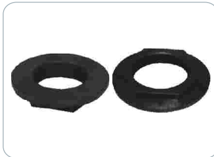
Axle Nut trailer (1=LH; 2=RH) Size : 60x2 p