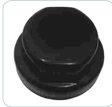
BPW - 135 x 2 mm (Inner Thread) 03.212.25.08.0 - 12T ECO PLUS