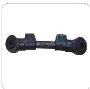
ADJUSTABLE ARM BPW 30mm COMPLETE 16275