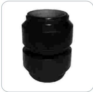
ROR - OEM PART No. 21011746 ID - 51 mm (White Plastic Pipe) OD - 78 mm Length - 105 mm