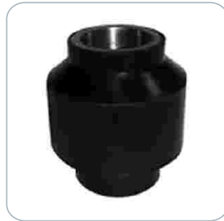
OEM PART No. 051196050, 0203160100 ID - 30 mm (Steel Pipe) OD - 60 mm, Length - 68 mm