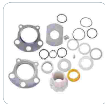
EORK-BCS-08 OEM PART No. 6503723