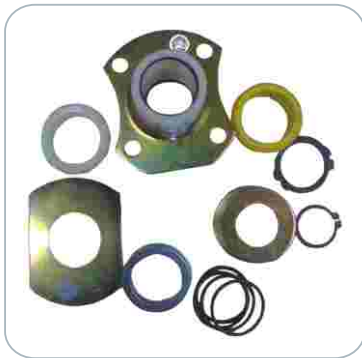
OEM PART No. 10690588M