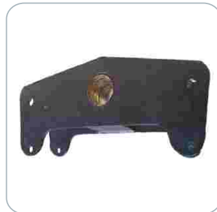
EQUALISER BPW 70mm 16015