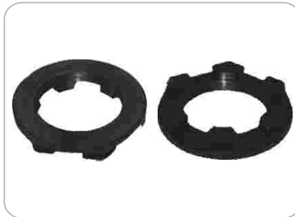
Axle Nut (Algeria Trailer) Size : 48x1.75 p