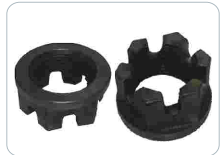
Haundrud/ Fruefauf Trailer Axle Nut Size : 60x4 p