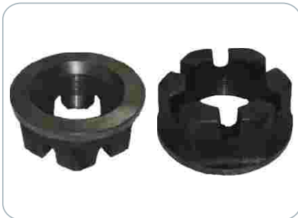
Axle Nut (BPW - 16 Ton) Size : 60x2 p Part NO. 03.262.17.11.0/ 03.262.17.03.0