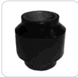
OEM PART No. 0511393030 ID - 36 mm (Steel Pipe) OD - 65 mm Length - 68 mm