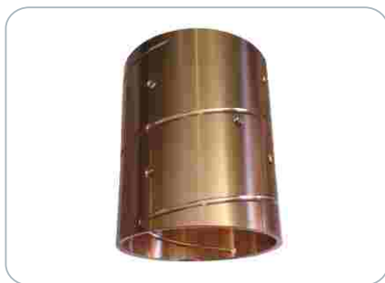
BRASS BUSHING 12 TONS 0311299020 EOUPA266