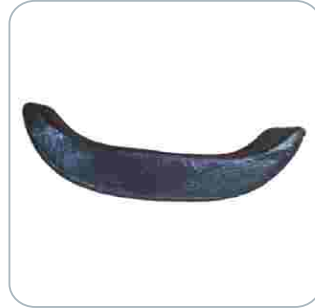
U BOLT GUIDE 16011