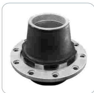
HUB BPW 16 TON 16112