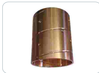
BRASS BUSHING 16 TONS 0311299040 EOUPA265