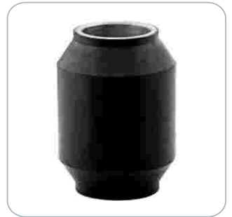
OEM PART No. 0511397100 ID - 60 mm (Steel Pipe) OD - 105 mm Length - 146 mm