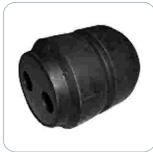
OEM PART No. 1628107 2 Holes - 19 mm OD - 85 mm Length - 99 mm