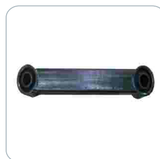
FIXED TORQUE ROD 30mm 16290