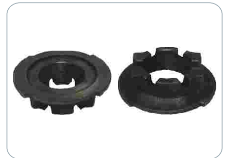
BPW (Eco Model - 16 Ton) Size : 60x2 p