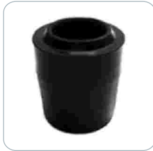
ROR - OEM PART No. 21202104 ID - 32 mm (White Plastic Pipe) OD - 57 mm - 48 mm Length - 57 mm