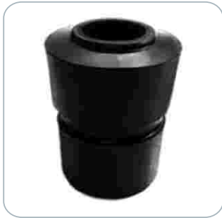
ROR - OEM PART No. 21020676 ID - 42 mm (Steel Pipe) OD - 89 mm - 70 mm Length - 112 mm