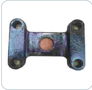
AXLE PLATE BPW (5 HOLE) 16009