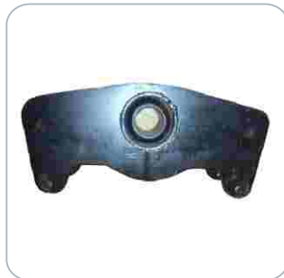
EQUALISER BPW 60mm 16014