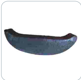
D BRACKET SMALL 16013