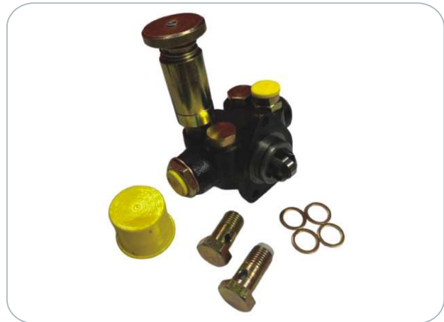
FEED / FUEL PUMP KIT O.E.M. PART No. 092100-3370 EOFP112, HINO