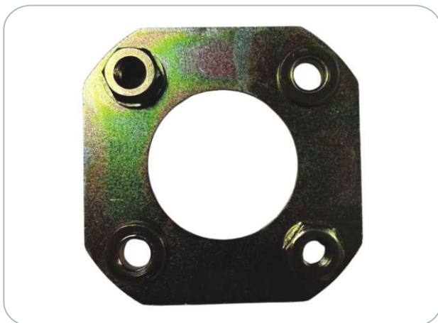
COUPLING FEED PLATE O.E.M. PART No. 21190000 EOFP202, HINO