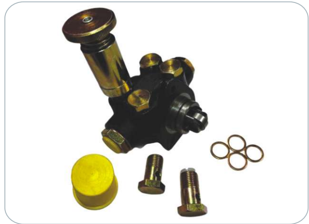
FEED / FUEL PUMP KIT O.E.M. PART No. 105237-4180 EOFIP106, HINO