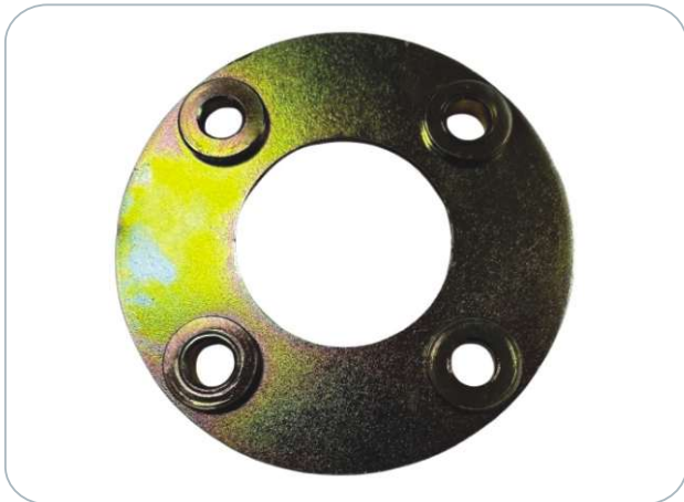
COUPLING FEED PLATE O.E.M. PART No. 21080000/092460-005 EOFIP204, HINO