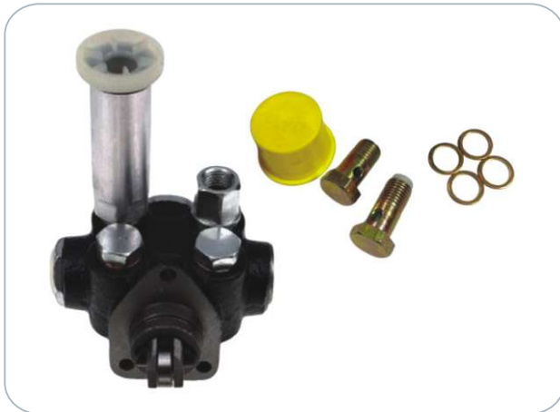
FEED / FUEL PUMP KIT O.E.M. PART No. 105237-4890 EOFP116, MITSUBISHI