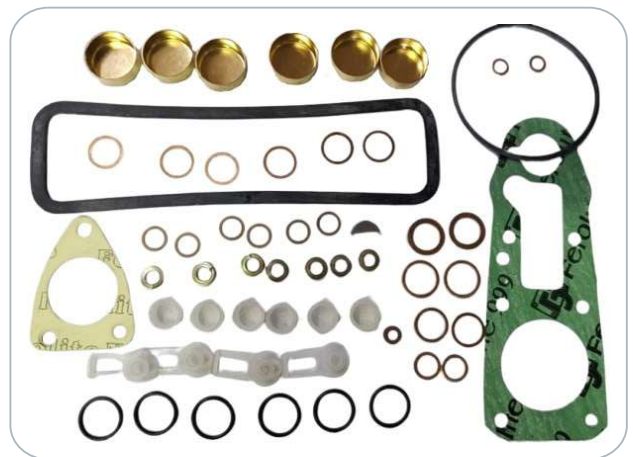
GASKET O.E.M. PART No. 1417010003