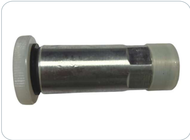
HAND PRIMING PUMP O.E.M. PART No. 22501-54010 EOFIP152