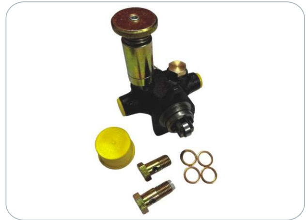
FEED / FUEL PUMP KIT O.E.M. PART No. 105217-4000 EOFIP105, MITSUBISHI