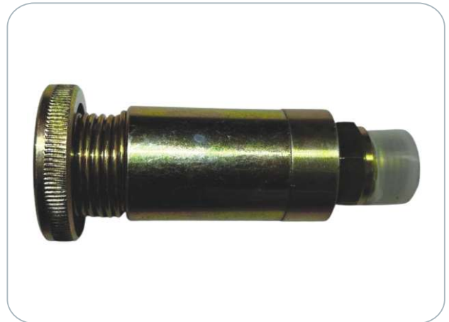
HAND PRIMING PUMP O.E.M. PART No. 152200-1120 EOFIP151