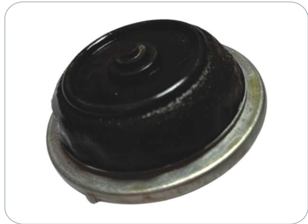
DIAPHRAGM O.E.M. PART No. 155020-8420 EOFP201, TOYOTA