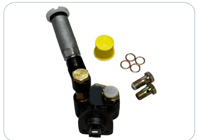
FEED / FUEL PUMP KIT O.E.M. PART No. 105237-6593 EOFIP109, MITSUBISHI