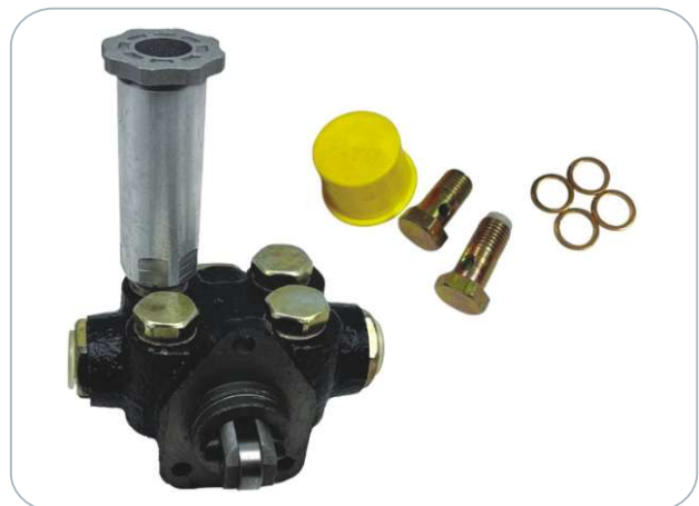
FEED / FUEL PUMP KIT O.E.M. PART No. 105217-1410 EOFIP114, HINO