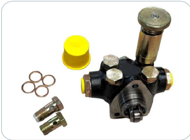
FEED / FUEL PUMP KIT O.E.M. PART No. 105237-1341 EOFIP110, ISUZU