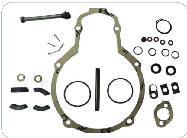
GASKET O.E.M. PART No. 1427010002