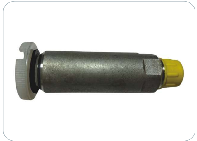
HAND PRIMING PUMP O.E.M. PART No. 092130-0220 EOFIP153