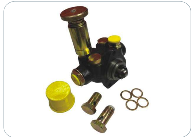
FEED / FUEL PUMP KIT O.E.M. PART No. 092100-3161 EOFIP107, HINO