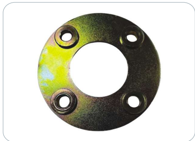
COUPLING FEED PLATE O.E.M. PART No. 21290000 EOFP203, HINO