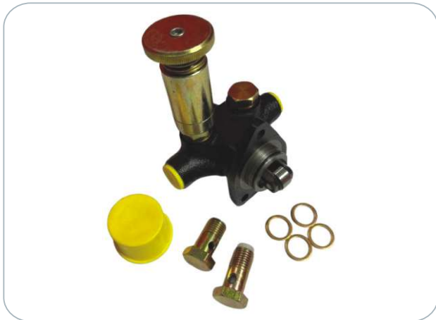
FEED / FUEL PUMP KIT O.E.M. PART No. 105210-1941 EOFIP103, MITSUBISHI