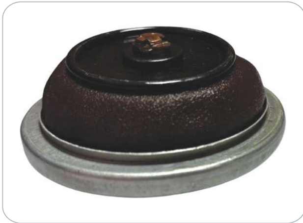
DIAPHRAGM O.E.M. PART No. 090580-0041 EOFP200, TOYOTA