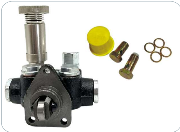
FEED / FUEL PUMP KIT O.E.M. PART No. 105237-4210 EOFIP115, MITSUBISHI