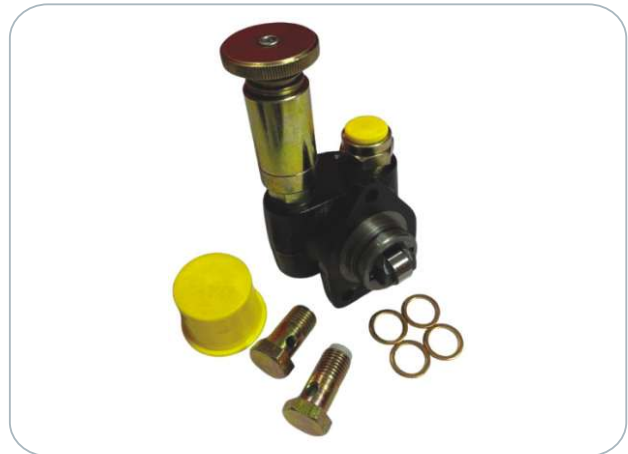
FEED / FUEL PUMP KIT O.E.M. PART No. 105220-5001 EOFIP104, KOMATSU, NISSAN