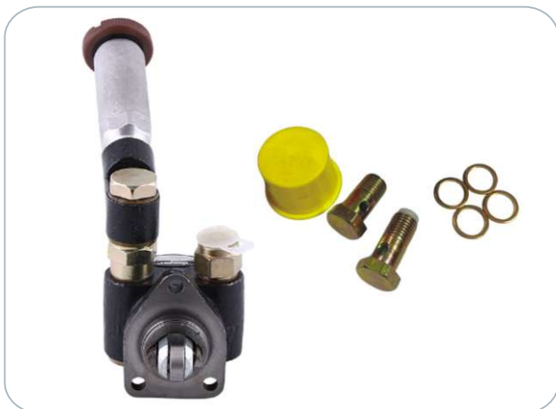
FEED / FUEL PUMP KIT O.E.M. PART No. 092100-2840 EOFIP108, MITSUBISHI