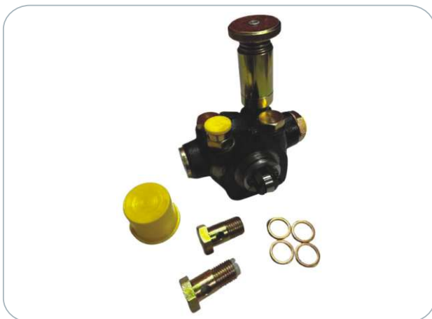
FEED / FUEL PUMP KIT O.E.M. PART No. 105230-1111 EOFIP111, ISUZU