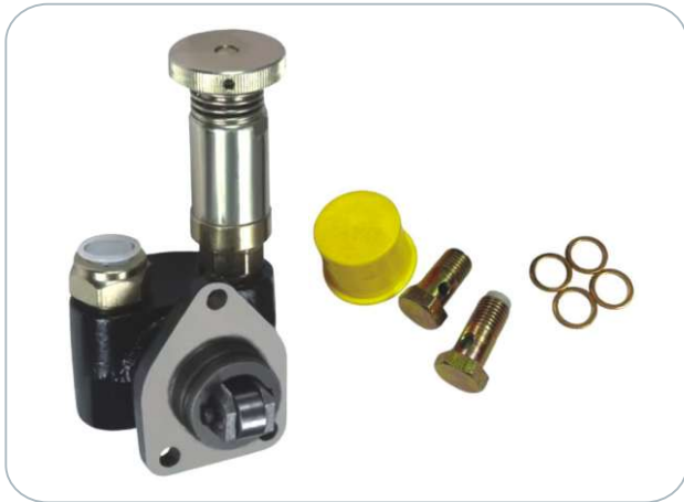
FEED / FUEL PUMP KIT O.E.M. PART No. 105220-1570 EOFIP113, ISUZU