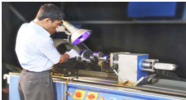
MAGNAFLUX - CRACK DETECTION