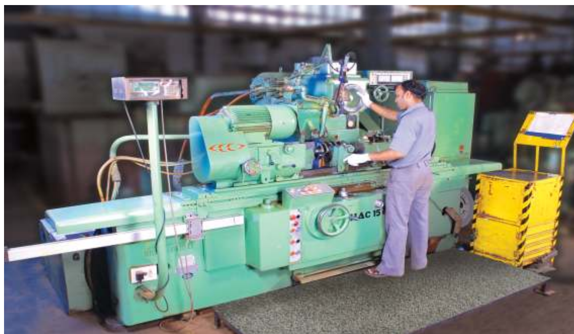
MAIN JOURNAL GRINDING