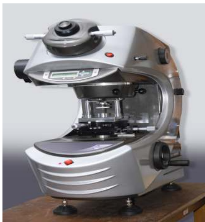
MICRO HARDNESS TESTER