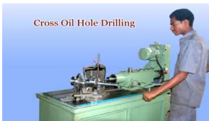
Cross Oil Hole Drilling