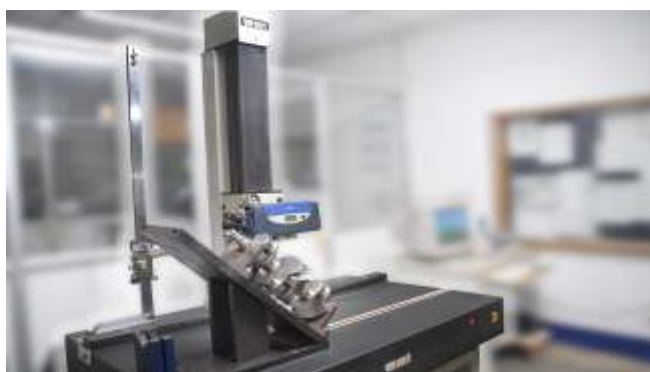
TAYLOR HOBSON - RADIUS BLENDING INSPECTION