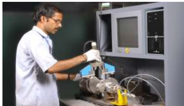
MULTI GAUGING - MB & CP DIA INSPECTION