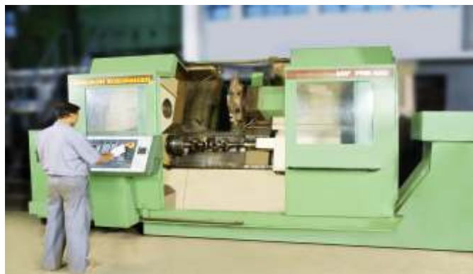
MAIN JOURNAL TURNING